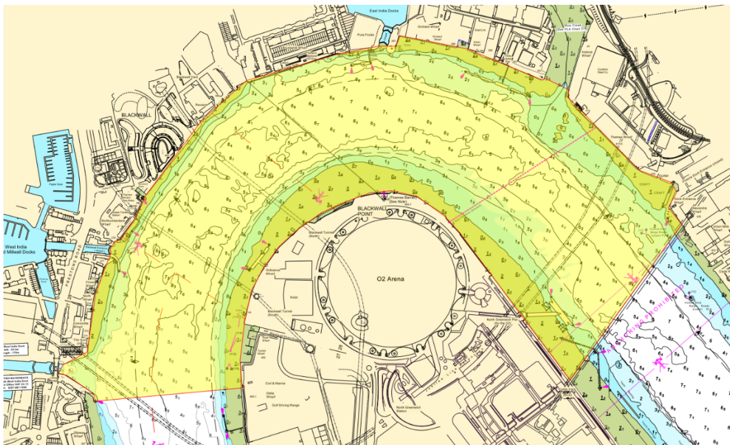
Chartlet 1 – extent of exclusion zone on Thursday 29 th April 2021

Owners and operators are reminded that no manned vessels other than emergency service vessels responding to an incident and vessels engaged in operations are permitted within the exclusion zone.