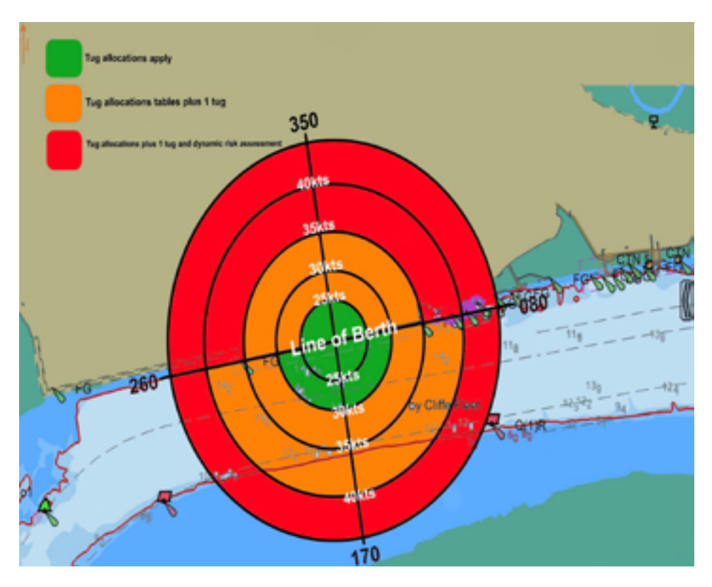
TABLE 4 - AUGMENTATION OF TOWAGE REQUIREMENT DUE TO WIND CONDITIONS